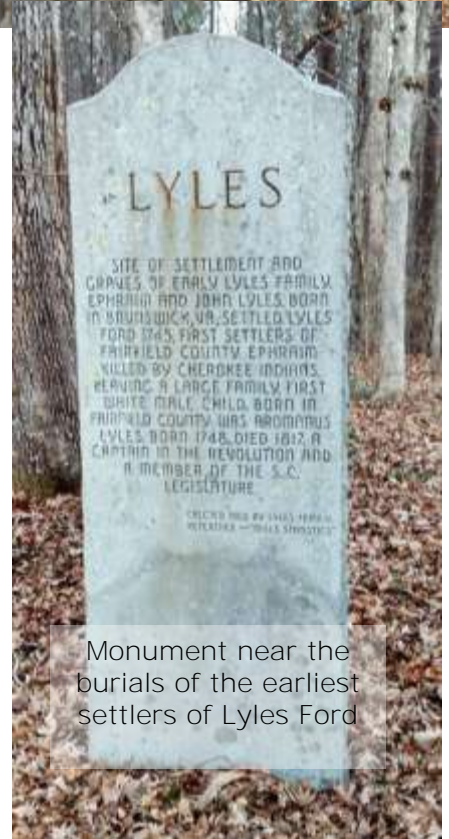
Monument near the burials of the earliest settlers of Lyles Ford