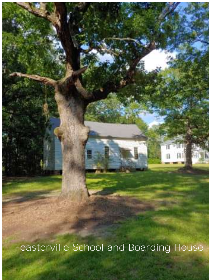
Feasterville School and Boarding House

Holiday Inn Express & Suites 120 Creech Road Blythewood, South Carolina 29016 (803) 333-0315